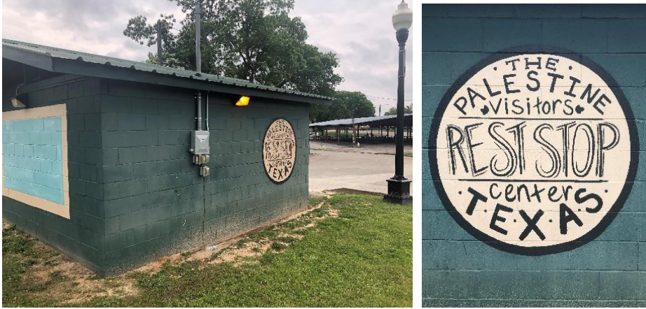
Current art on the West side.